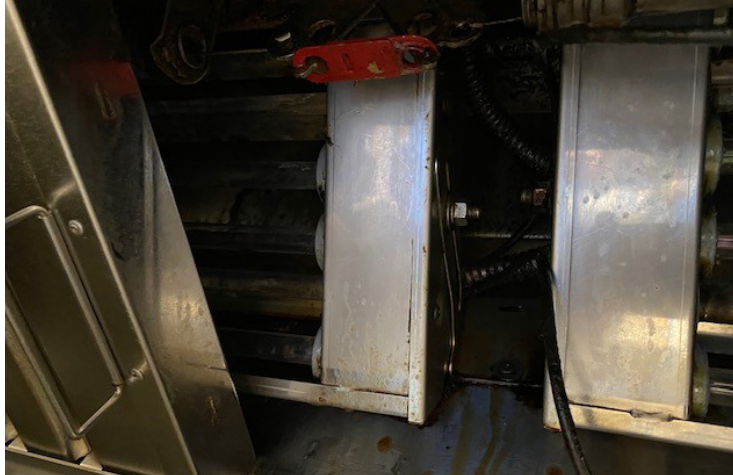
Grill - UV-C Lamps are placed behind the exhaust hood

The restaurant has just cleaned/wiped the lamps 2 times a week, and the system works just perfect.