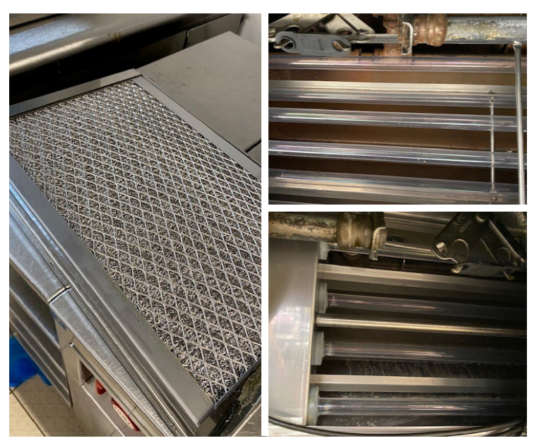
Fryer 1 and 2 - UV-C Lamps and exhaust filter

Just after 10 weeks the JIMCO's Kitchen Pollution Control system (KPC) got installed, it is still looking good and in good condition with no issues at all. That pleases the JIMCO partner in Spain, Juel Concept & Consulting.