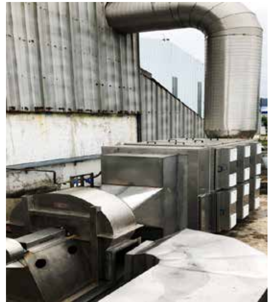
A fishery located in Calbuco, in the Los Lagos region.

The sources include an exhaust pipe connected to the JIMCO FLO-K system, which treats the exhaust air in two phases. First, UV light and ozone are used to reduce odors, and then a catalyst is employed to reduce the acidity of the exhaust air by converting H_2S into SO_2 .