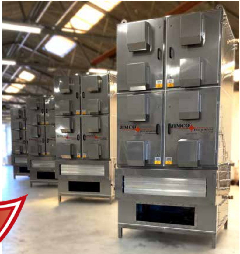
4 x FLO-P unit - ready for delivery to Iglo